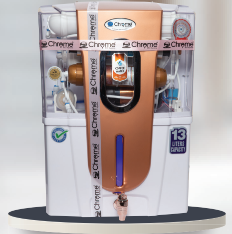
Dream Copper White