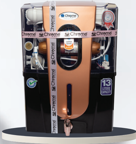
Dream Copper Black